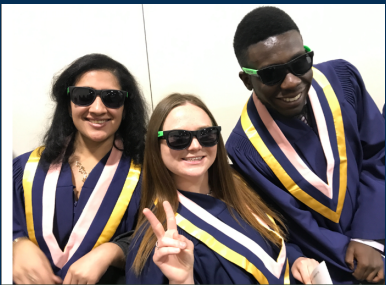
Shared from YRDSB Special Education Resource Team