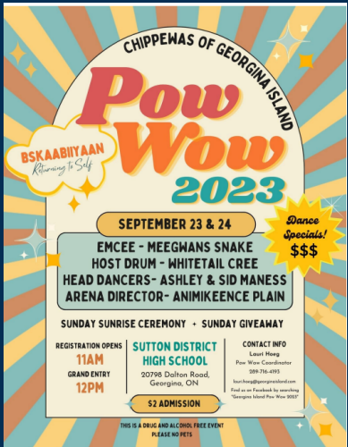
Shared from the Chippewas of Georgina Island First Nation