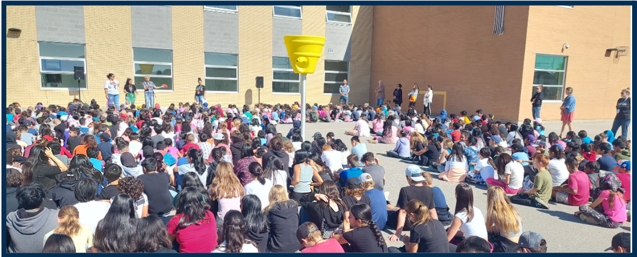
Students participate in the Terry Fox Assembly