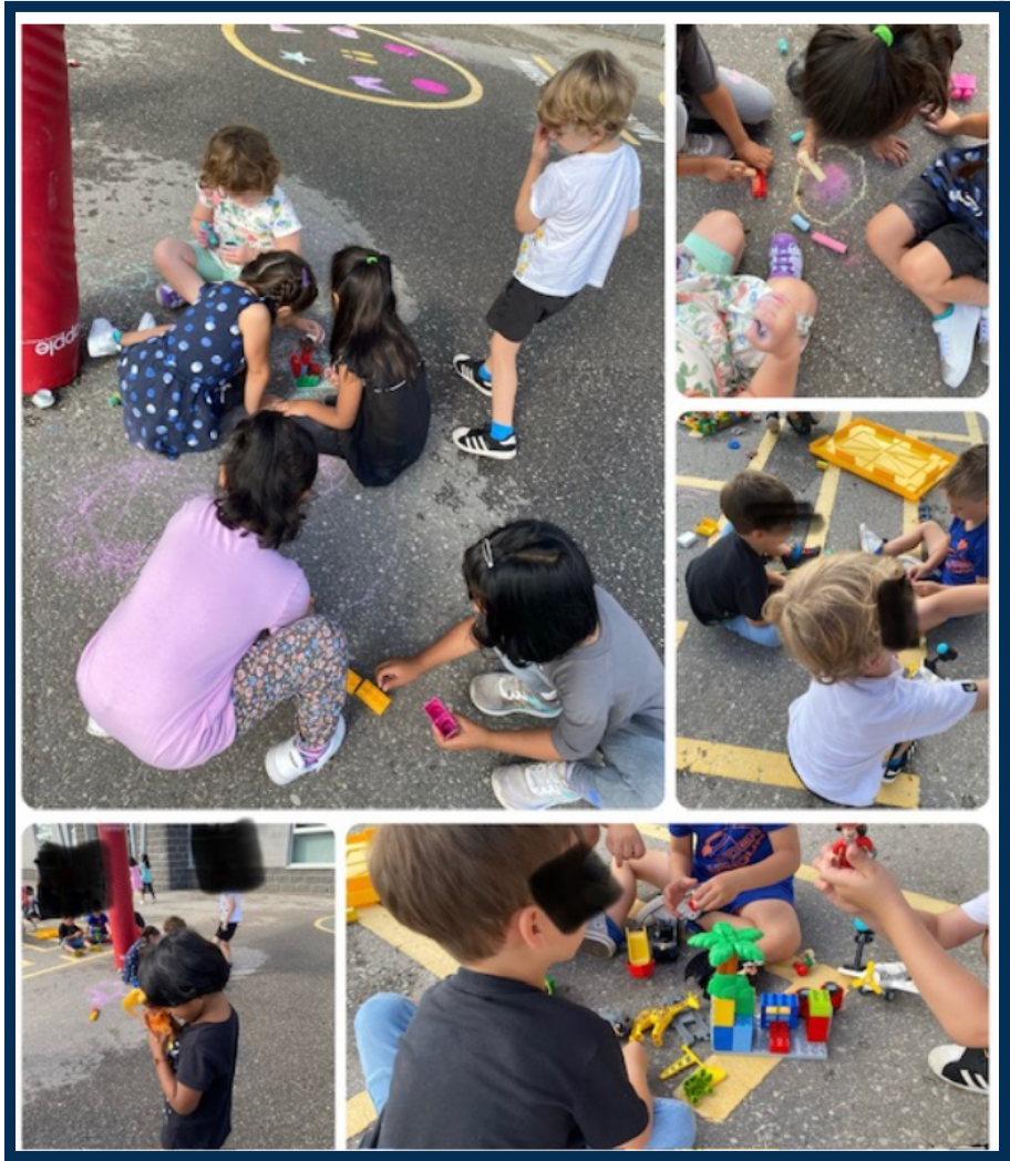
Kindergarten students play together outdoors